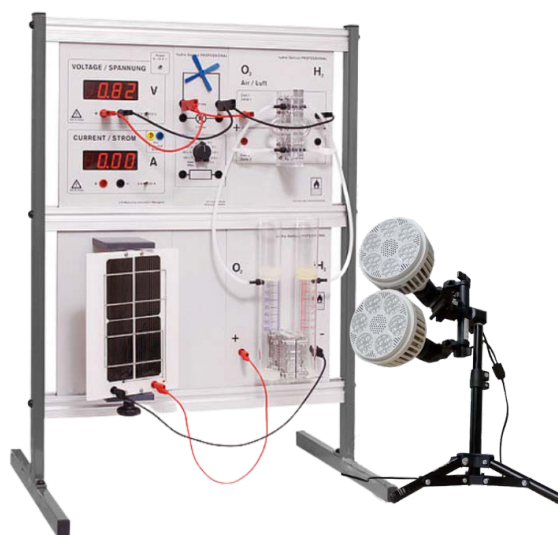
Lamp not included! has to be ordered separately

The Dr FuelCell® Professional provides support in the form of pre-configured demonstration experiments for presentation to the class. Based on solar hydrogen technology, the single modules reproduce a complete energy cycle.