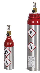
MHS 200 Art.-Nr. K00-0648

An integrated quick coupling allows an easy and safe connection to an individual hydrogen source. The storage is equipped with a pressure and temperature relief valve to avoid dangerous conditions.