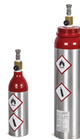
MHS 200 Art.-Nr. K00-0648

An integrated quick coupling allows an easy and safe connection to an individual hydrogen source. The storage is equipped with a pressure and temperature relief valve to avoid dangerous conditions.