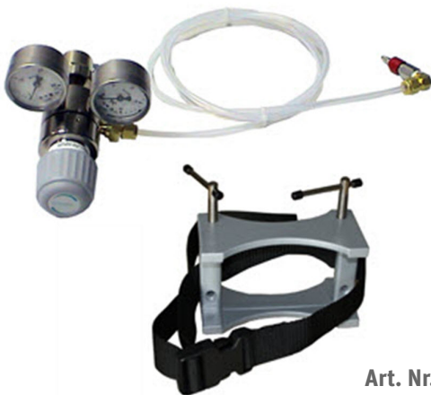
Art. Nr. 631