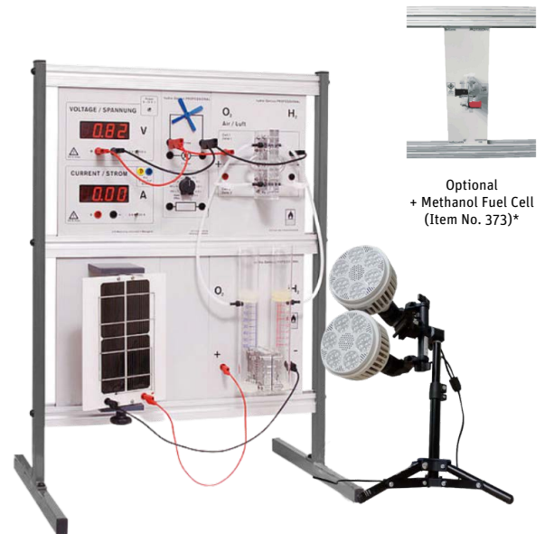
Lamp not included! has to be ordered separately

The Dr FuelCell® Professional provides support in the form of pre-configured demonstration experiments for presentation to the class. Based on solar hydrogen technology, the single modules reproduce a complete energy cycle.